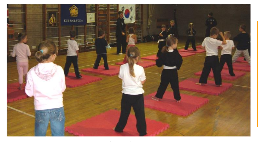
Some of our Little Dragons in action